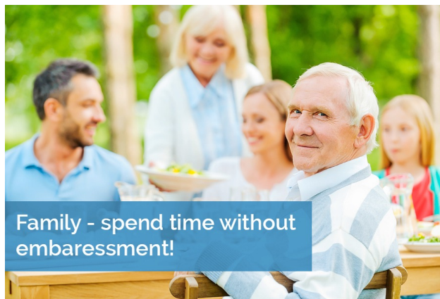
Family - spend time without embarrassment!