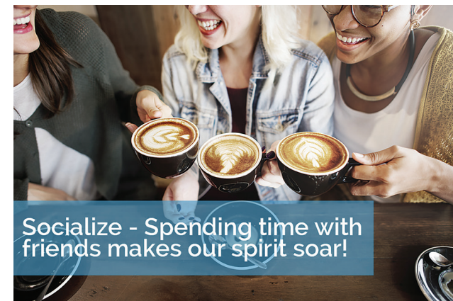
Socialize - Spending time with friends makes our spirit soar!